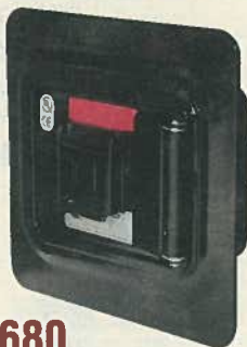
#1680 Black Recess Mount, Hinged Door with Tamper Switch $255.00