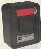
Knox-Box Model #1657 Dark Bronze Surface Mount, Lift-off Door