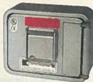
Knox-Box Model #1662 Aluminum Surface Mount, Hinged Door