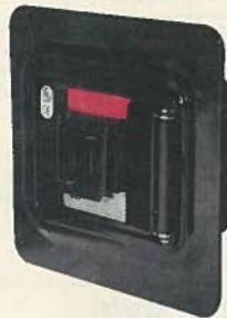
Knox-Box Model #1678 Black Recess Mount, Hinged Door, NO Tamper Switch