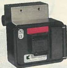
Knox-Box Model #1659 Black Surface Mount, Hinged Door with Door Hanger Bracket